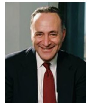
Senate Majority Leader Charles Schumer