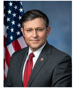
Speaker of the House Mike Johnson