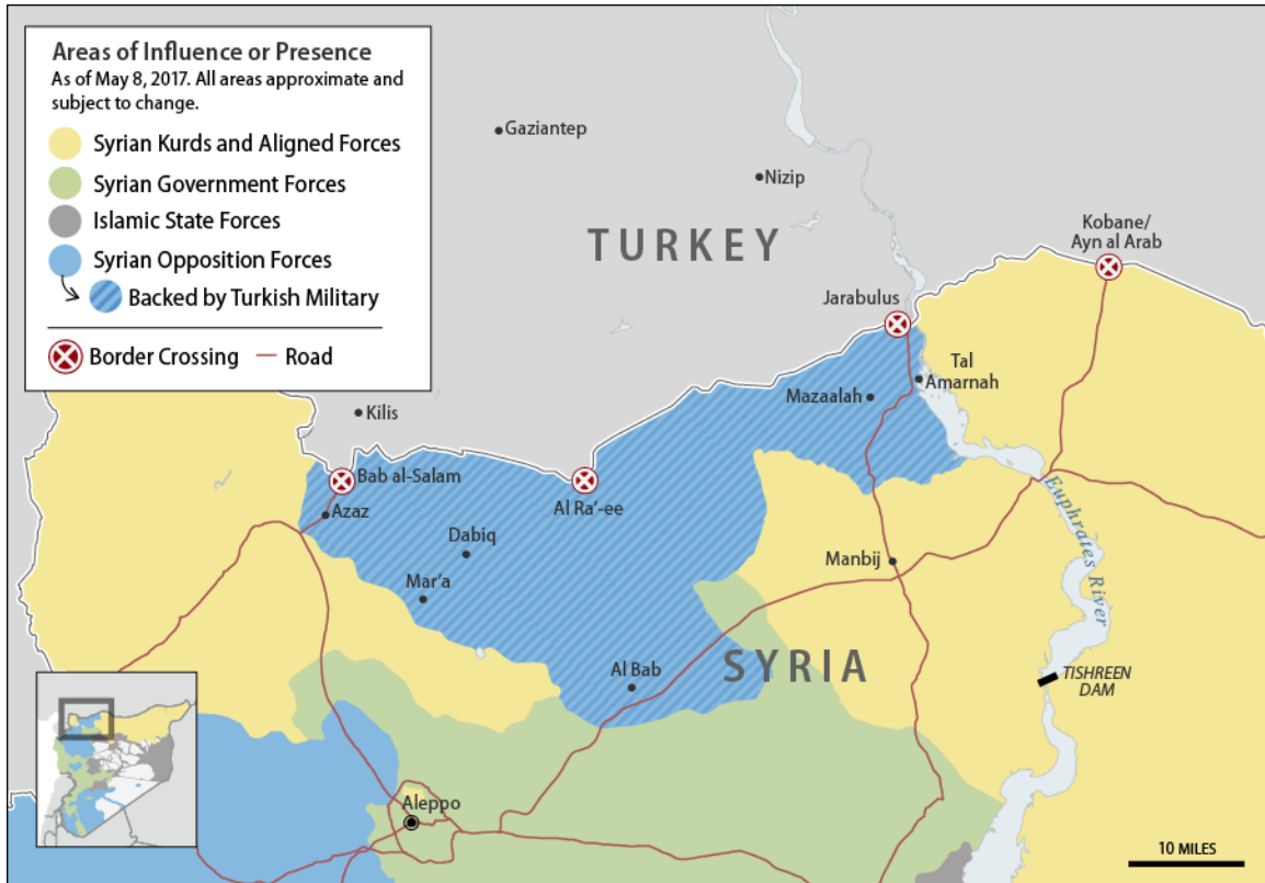
Figure 3. Syria-Turkey Border As of May 8, 2017