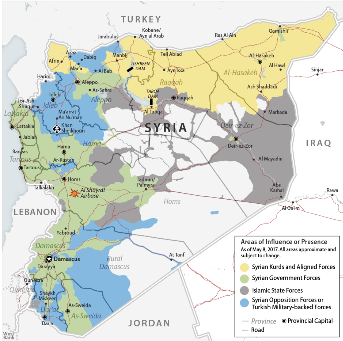
Figure 1. Syria: Areas of Influence

Source: CRS using area of influence data from IHS Conflict Monitor, last revised May 8, 2017. All areas of influence approximate and subject to change. Other sources include U.N. OCHA, Esri and social media reports.