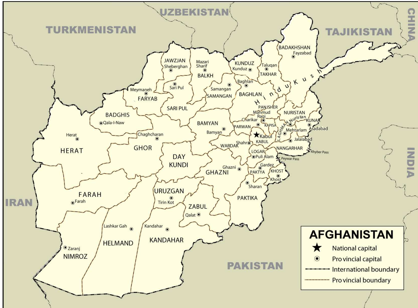
Figure A-I. Map of Afghanistan